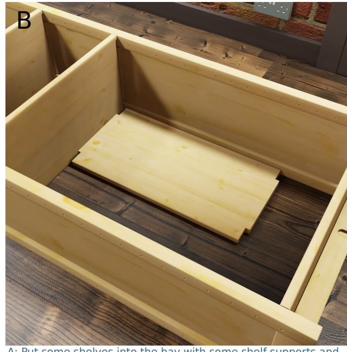
A: Put some shelves into the bay with some shelf supports and use a shelf as a square like this.