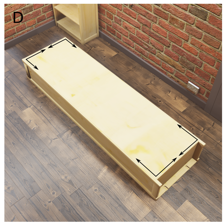
A: Tacks should be used 15cm/20cm apart around the edge working from the corners.